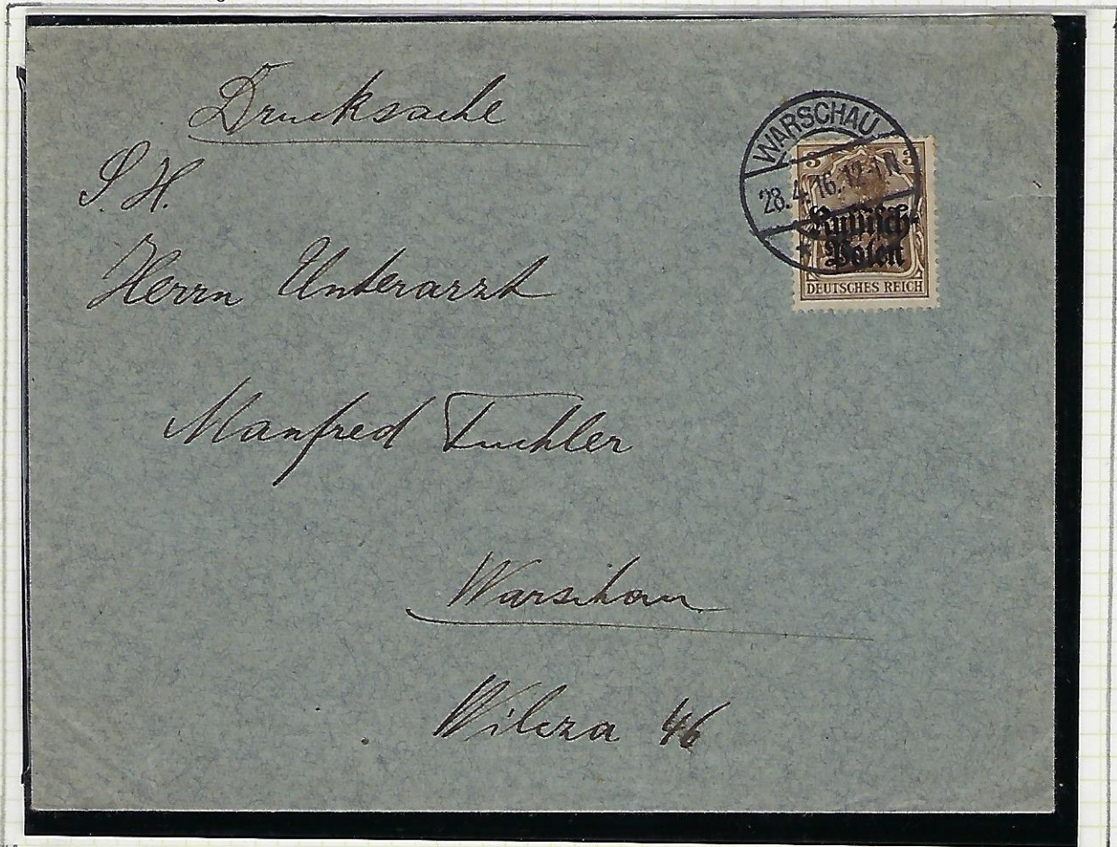
28.4.1916: Warsaw Local Post. Cover with 3(Pf) brown Germania stamp over-printed "Russisch Polen" and, on the reverse, a 2 gr Warsaw Municipal Post stamp.