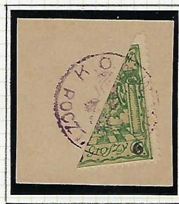
Warsaw 8 b: Halved \Delta (background slightly darker). Cancellation purple