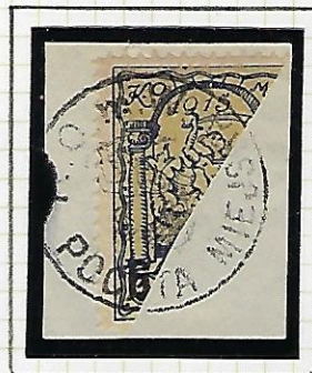
Warsaw 6 I (iss. 22.11.15)