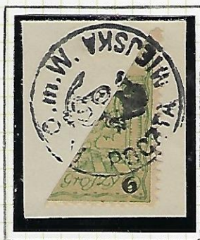
Warsaw 8 a: Halved \Delta

(a) Surcharge on 5 Groszy green / light grey sandstone background: