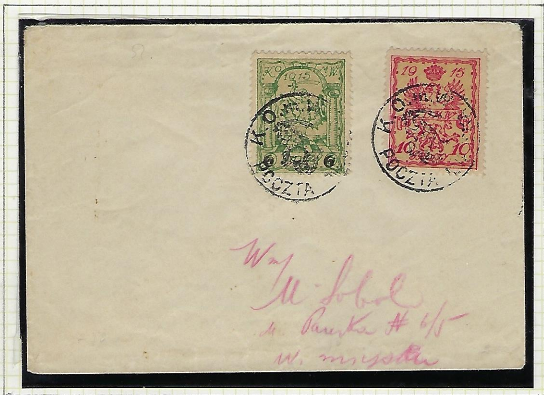
Cover with 6 + 10gr municipal stamps and municipal postal service cancellation only.