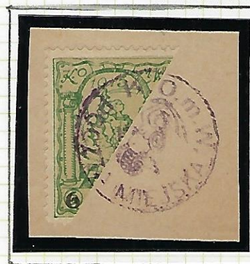
Warsaw 8 b: Halved \nabla (background slightly greener). Cancellation purple