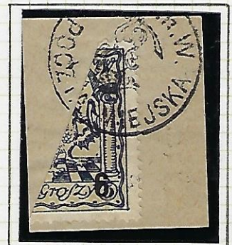
Warsaw 6 I (iss. 22.11.15)