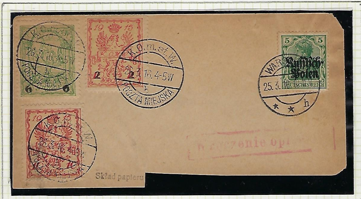
25.3.1916: 5Pf German Occupation stamp of Russian Sector of Poland with 6 + 2 + 10gr Warsaw Municipal stamps with Municipal Postal Service cancellation 26.3.1916. Włączenie Optaczone