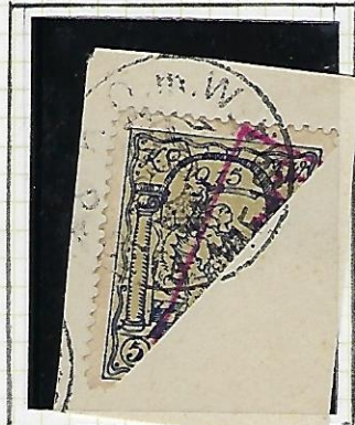
Warsaw 4 (iss. 30.9.15)