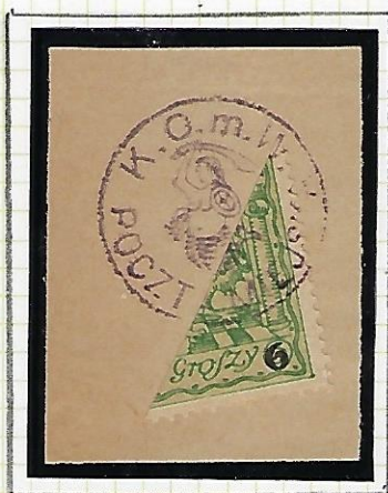
Warsaw 8 b: Halved \Delta Cancellation purple