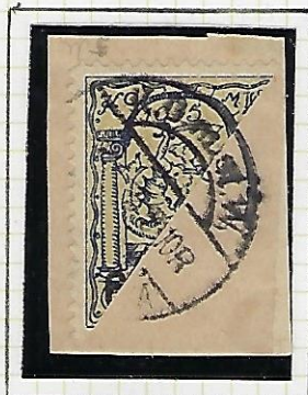
Warsaw 6 I (iss. 22.11.15)