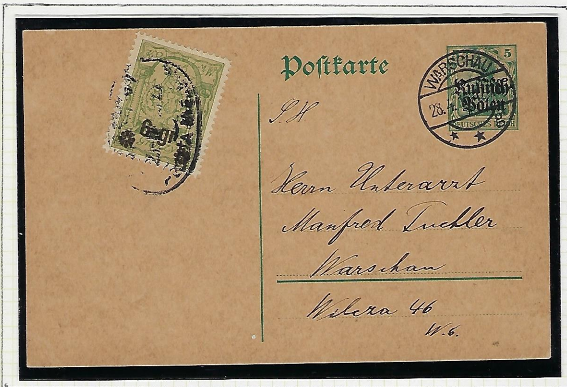
28.4.1916: Warsaw Local Post. German pre-printed 5 Pf post card over-printed "Russisch Polen" and with 6 Gr Warsaw municipal stamp added for local delivery.