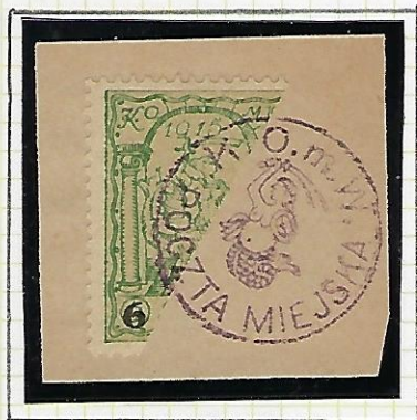
Warsaw 8 b: Halved \nabla Cancellation purple