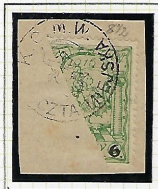
Warsaw 8 a: Halved \nabla

(b) Surcharge on 5 Groszy green / dark (sombre) grey-sandstone background: