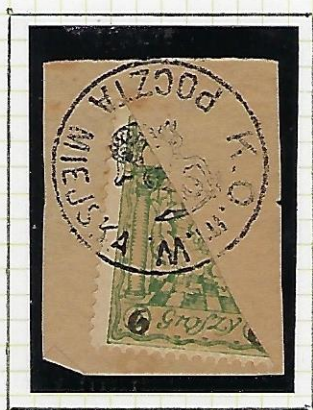
Warsaw 8 b: Halved \Delta Cancellation black

(b) Surcharge on 5 Groszy green / dark (sombre) grey-sandstone background: