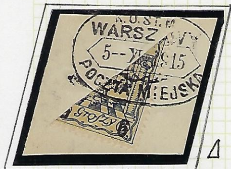
Warsaw 6 I (iss. 22.11.15) Cancellation date 5.IX.15