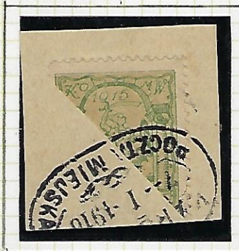
Warsaw 1 (iss. 23.9.15) Cancellation date 7.1. 1916, therefore C.O.D.

Halved Stamps: Because of shortages stamps of Warsaw Nos. 1, 3, 4, 6I and 6II were cut diagonally or almost vertically, mainly for use of printed matter. The use of halved stamps was allowed only until December 1915, but the Post continued to cancel them as a favour.